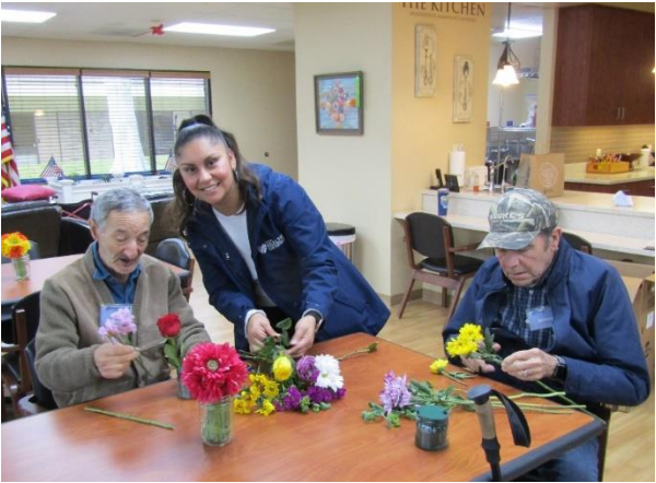
Photo Credits: Camarillo Health Care District Adult Day Center Easterseals – S. California